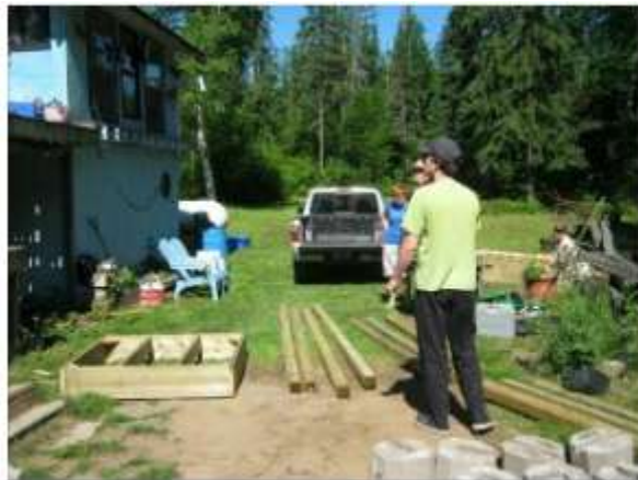
laying out the materials...