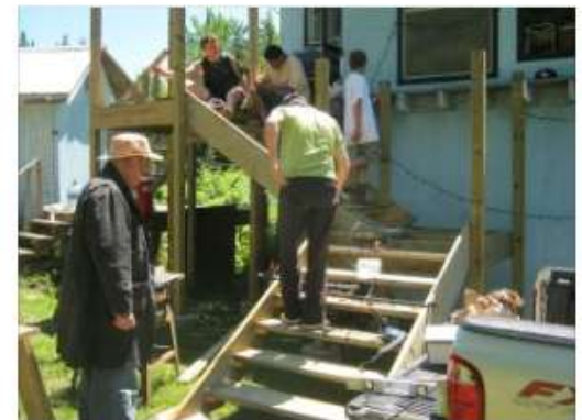
Say something about this photo...