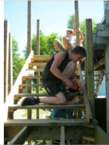
Say something about this photo...