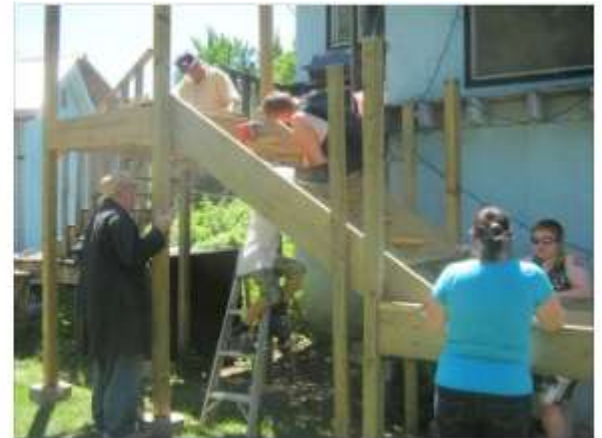
first set of stairs...