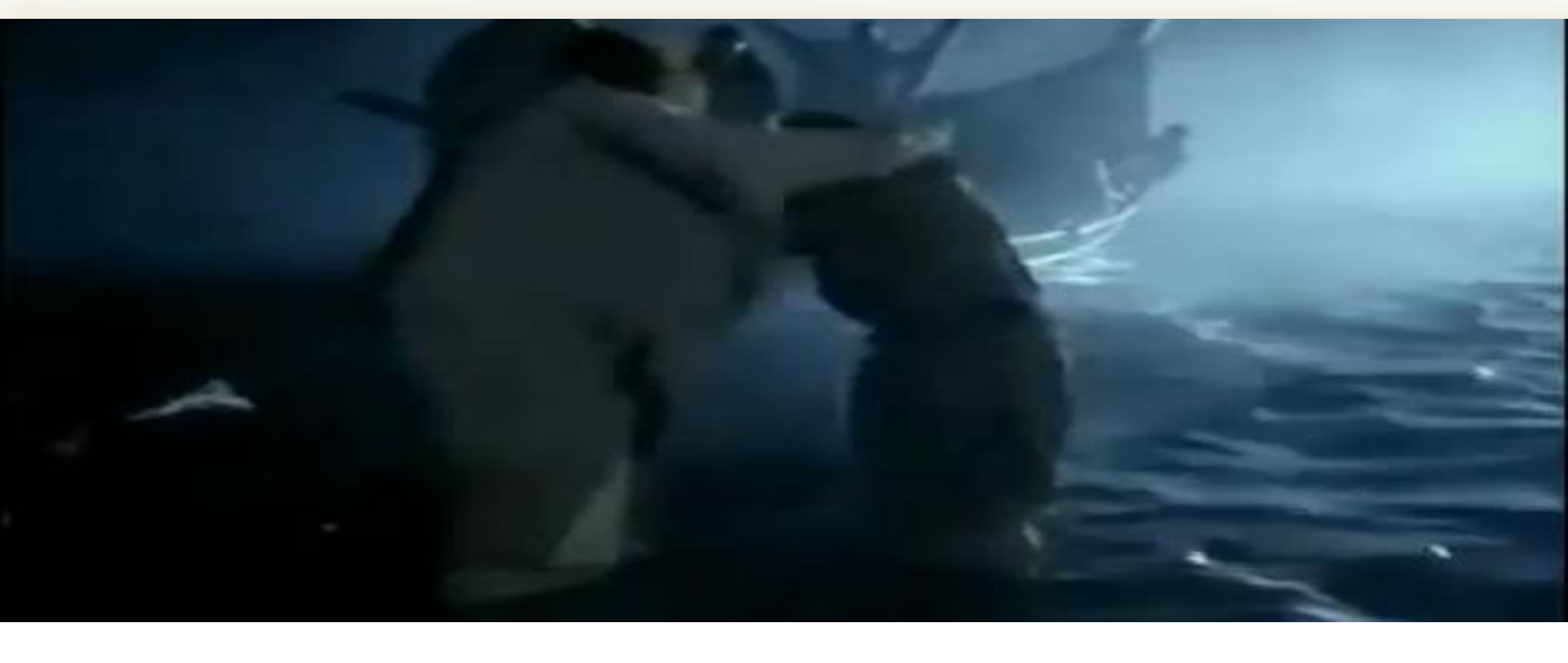
Where do you want to walk with Jesus?